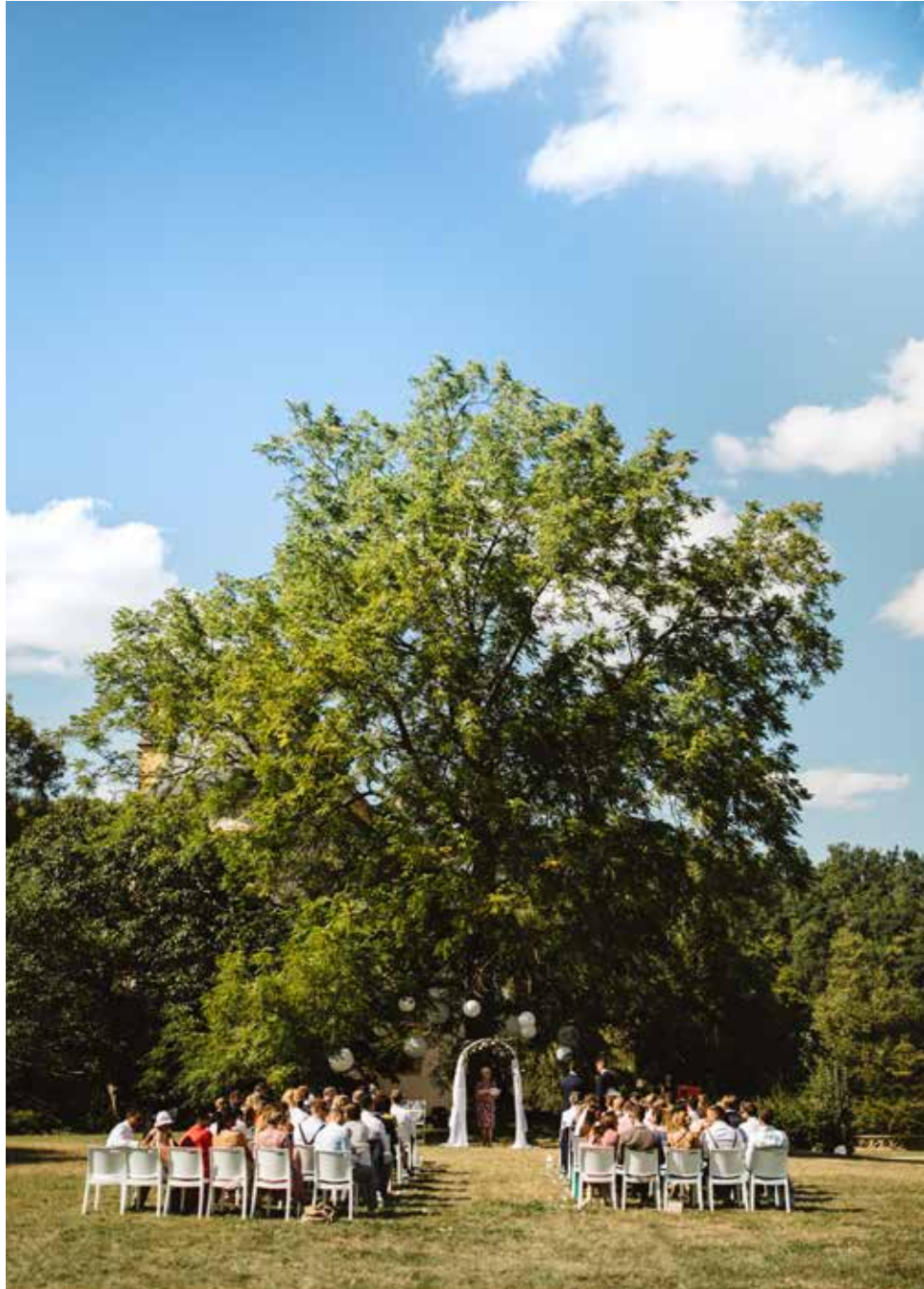
under the walnut tree