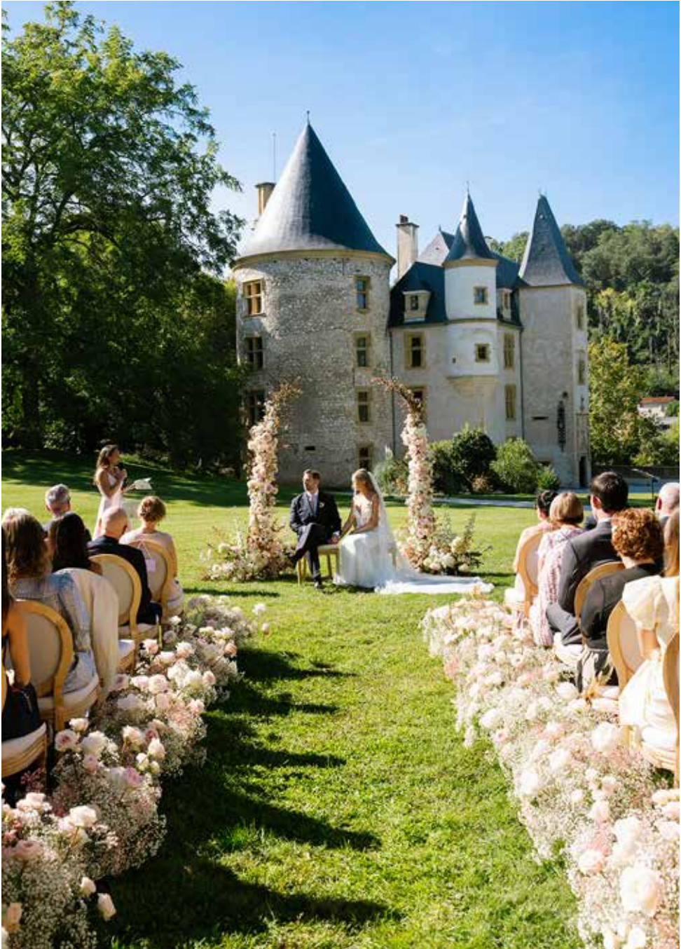
in front of the Chateau