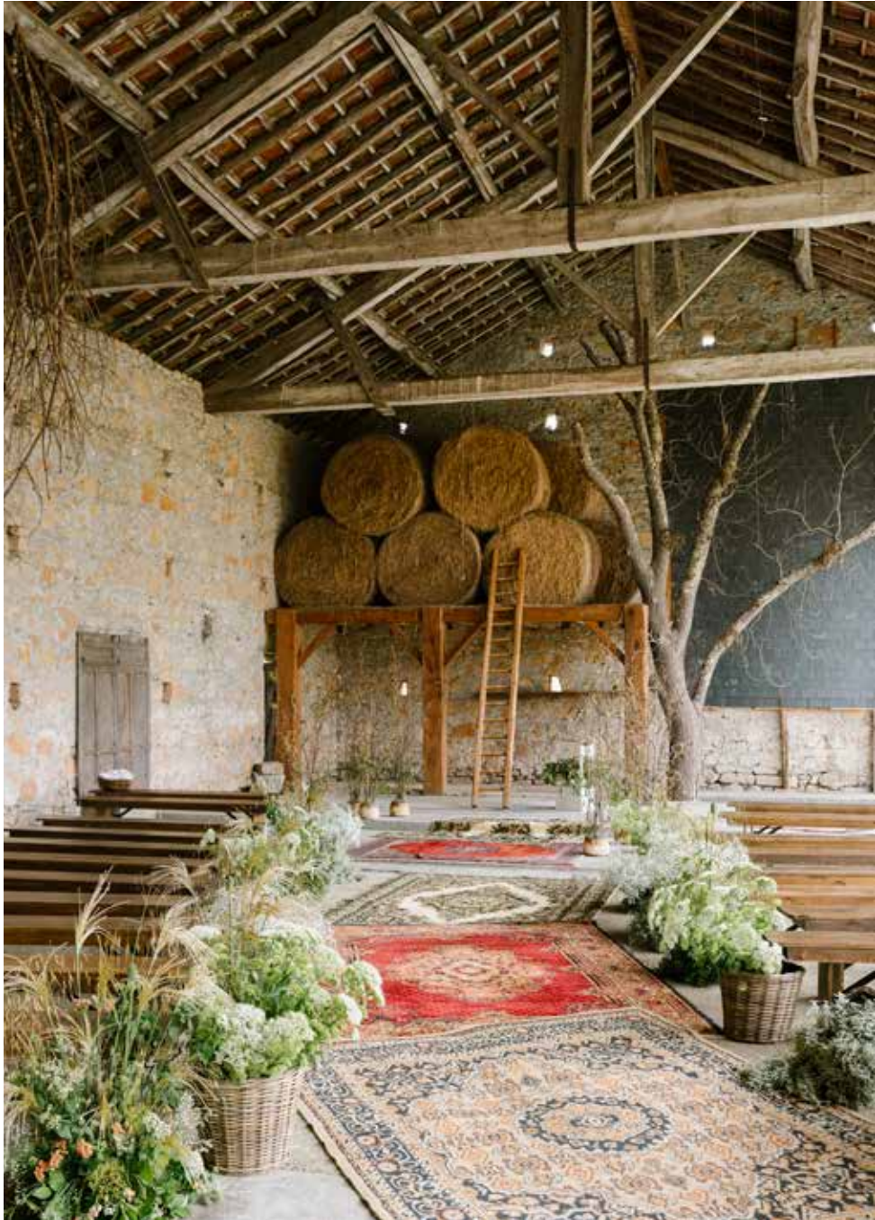
under our massive woodbarn